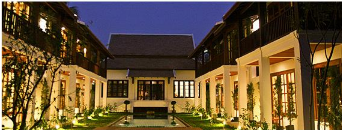
Le Sen Boutique Hotel