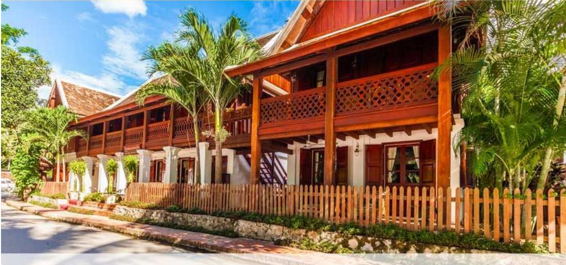
Mekong Riverview Hotel