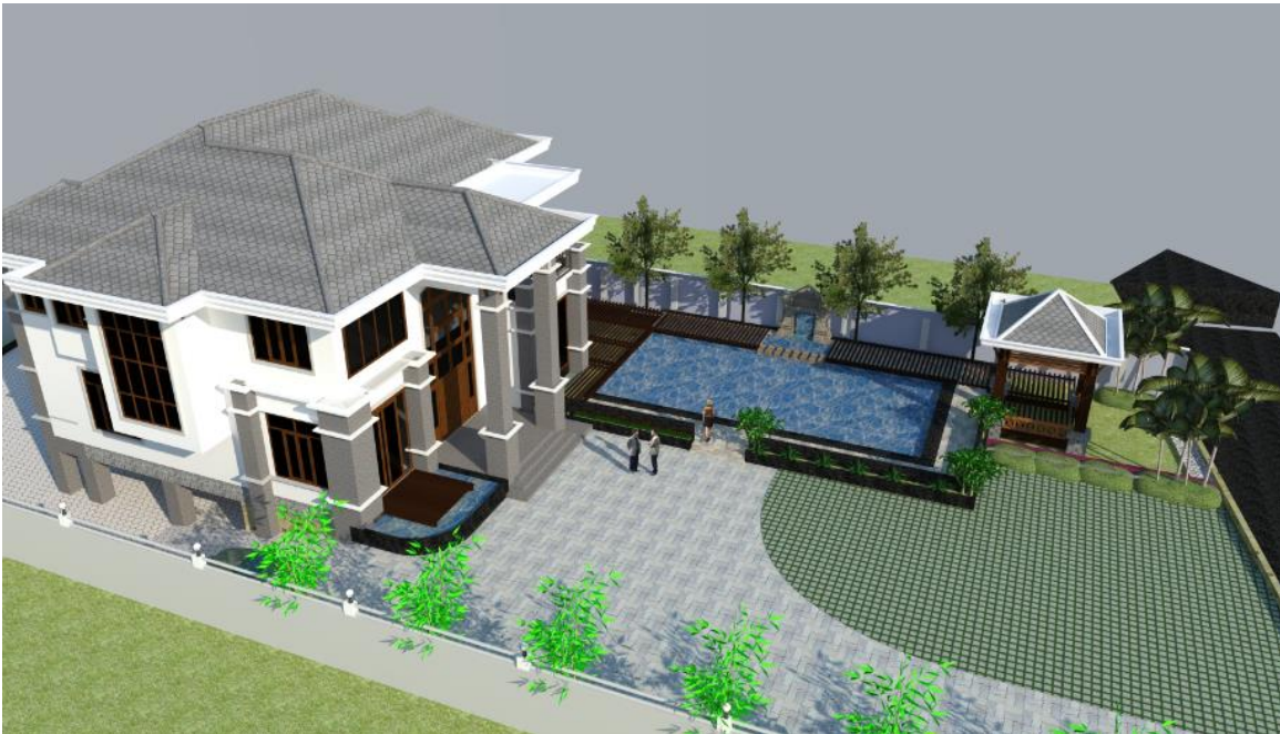
Residential House and Landscaping