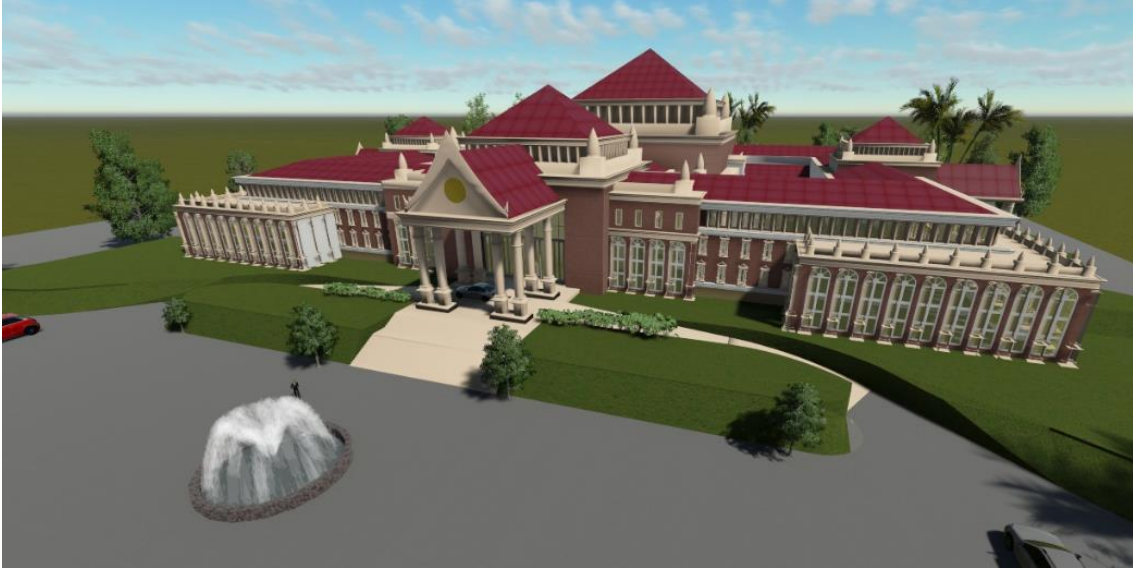
New Lao National Assembly